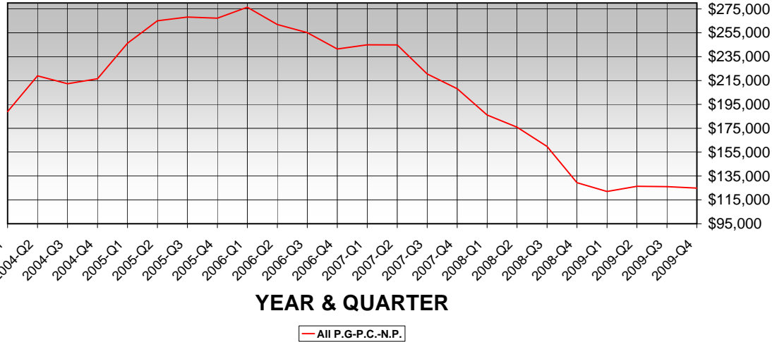
SINGLE FAMILY DETACHED AVERAGE SALE PRICE (ALL)