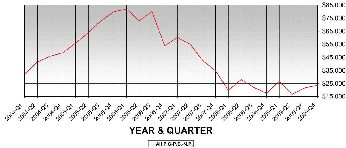
VACANT LOTS AVERAGE SALE PRICE (ALL)